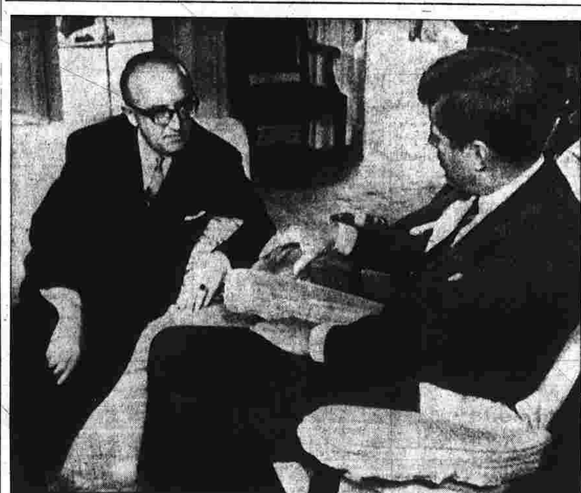
Presidents of U.S., Common Market, Meet

President Kennedy and Dr. Walter Hallstein, president of the European common market, talk today in the President's White House office. The meeting was one of several being held by Dr. Hallstein with government officials. He is seeking establishment of an Atlantic economic partnership between the United States and the western European community.